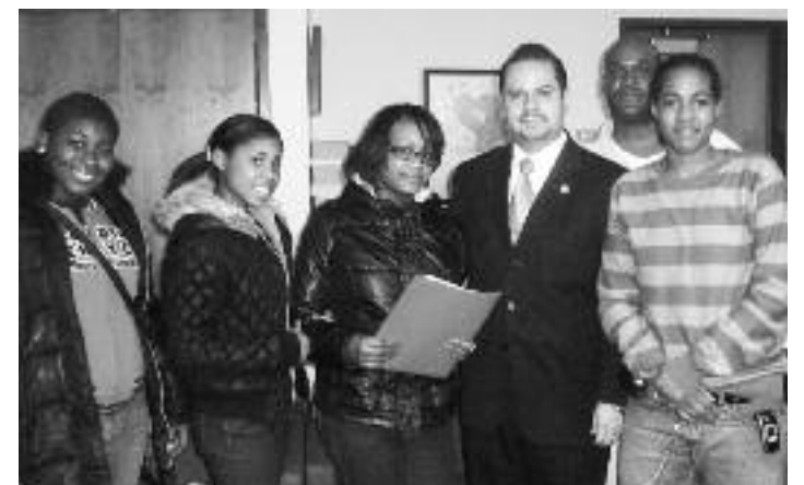
During the 2008 Re-entry Roundtable Advocacy Day, Fortune Society staff and clients advocated for the removal of counter-productive barriers to reentry.