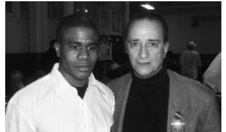
David Rothenberg, Fortune Society founder and longtime criminal justice advocate, led a team of advocates in meetings with NYS legislators.